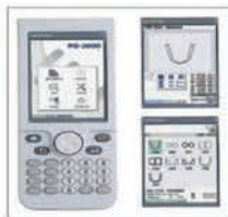
The PD-3000*, a programmer with a large color LCD, easy-to-understand