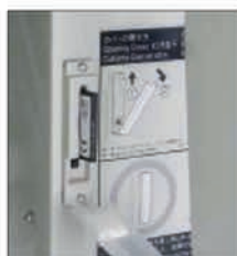
Large-capacity memory built-in

The machine can store large amounts of data (512 patterns, 500.000 stitches) in its internal memory. There is no need of loading a sewing program each time for changing the sewing pattern to be sewn. In addition, the CF (CompactFlash) card with fast read and write speed is adopted as storage media. Multiple sewing programs can quickly be copied and moved to other sewing machines or to computers for sewing data management.