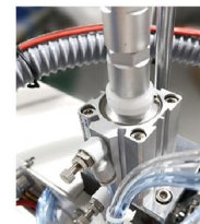
Easy adjust Upper column route