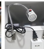
Easy change LED lamp