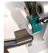
360° Adjustable nozzle