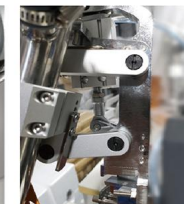
Double link swing arm