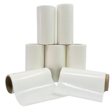
Hot melt adhesive film

Supply all kinds of color, material of hot-melt tapes, seam sealing tapes.