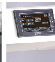
Touch screen, temperature control and display in on screen